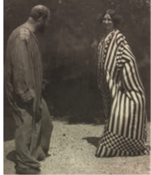
..... Gustav Klimt in his painter's coat and Emilie Flöge in a reform dress on the Attersee, photographed by Heinrich Böhlér, 1909 .....

painter's smock in the Villa Paulick garden. They are precisely dated 11 to 13 th and 14 th September 1913, as is verified by Gustav Klimt's short stay on the Attersee. 12 They are unique documents in the history of photography, showing the two protagonists on the only known color photographs on Lumière Autochrome plates. The »Lumière Autochrome mosaic screen plate process« introduced onto the market by the Lumière brothers in 1907 was greeted as a sensation by amateur photographers: for the very first time it was possible to photograph the world »in natural colors« (thus the marketing slogan of the Lumière brothers). This technical innovation targeted the taste of amateur photographers: at last they were able to document the family and holidays in a color process (unfortunately not cheap).