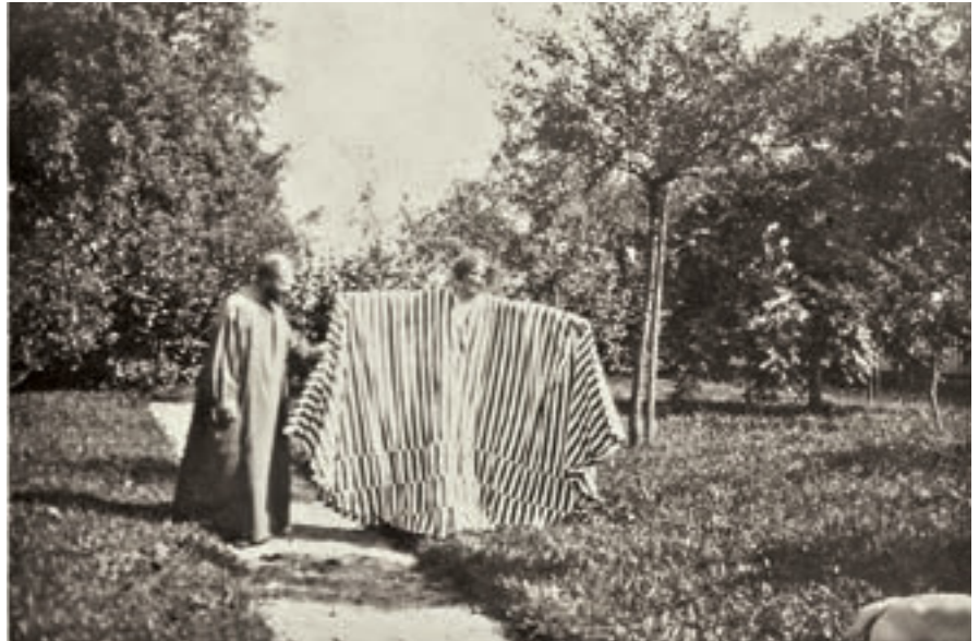
..... Gustav Klimt in his painter's coat and Emilie Flöge in a batwing dress in the garden of the Villa Oleander on the Attersee, 1908 .....

visual composition. What makes a snapshot photograph distinctive is that it picks out a random moment in time within an event, usually of a movement, and captures it as a snapshot. Part of the procedure involved the subject taking a pose shortly before the »click« of the shutter release. The photograph-chronicler observed the actions from within, participated in the event, and was not seldom in a familiar relationship with the subjects. The inventors of snapshot photography are mostly unknown, since the (fast) capture of images and motifs was regarded as more important than naming the snapshot photographer.