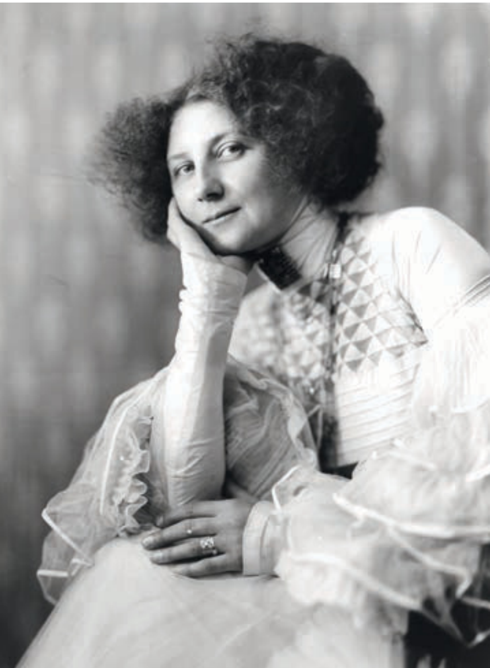
..... Emilie Flöge, photographed by the studio d'Ora-Benda, 1909 .....